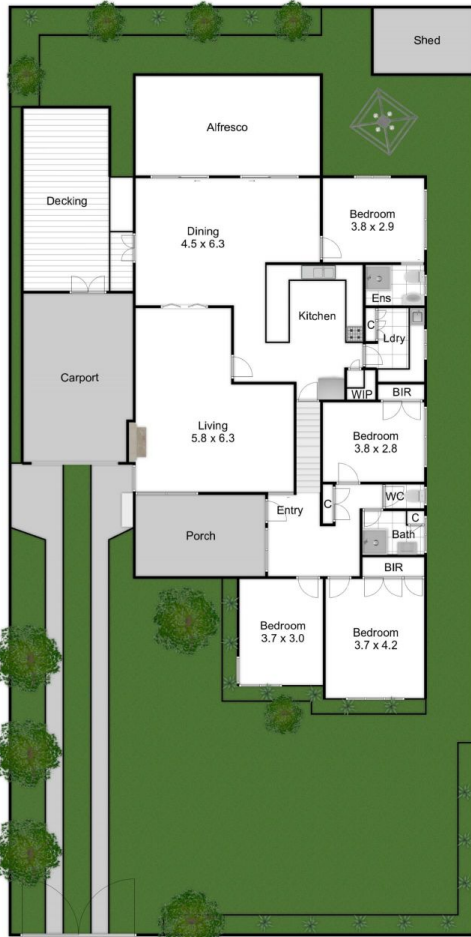
Ground Floor/Site Plan