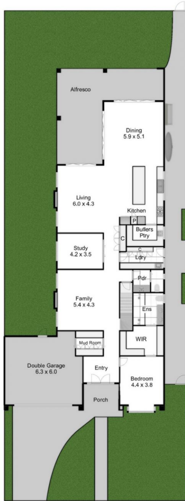
Ground Floor/Site Plan