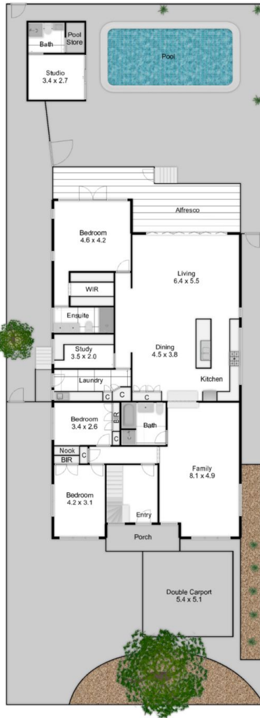
Ground Floor/Site Plan